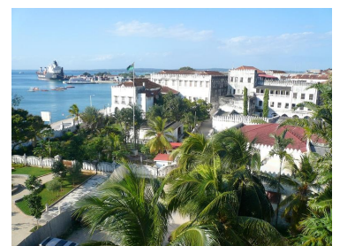
Above: Stone Town, Zanzibar